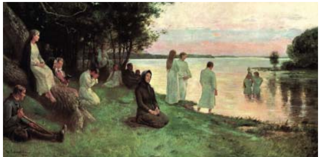
“The Baptists” was painted by Gustaf Cederström in 1886