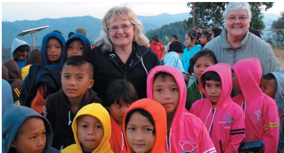
Children at a hostel in northern Thailand during a visit from the Swedish Baptist Women's Federation.