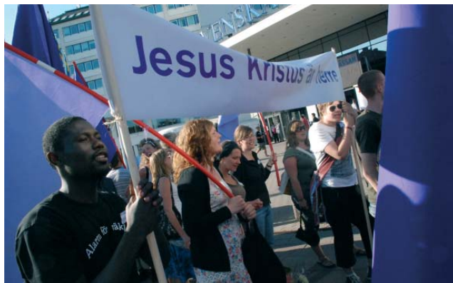
The youth federation equemenia was formed in 2008 in Göteborg.

women, with Thailand as the main focus area. In Sweden, SBKF arranges summer camps for single mothers and their children, and actively works to stop human trafficking.